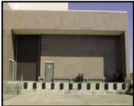
view of loading dock

Loading dock entrance is on the corner of Front St. & 7th St. *Stacking Motor available in Shop Area.* (48/12fpm) The dock is 3' 10" high and 6'6" wide x 40' long. The loading door is 9' 6" wide and 16' 0" high. The loading dock is off-stage left and there is direct access from it to the stage. (3) trucks will fit into loading dock at one time with the longest to park closest to the steps. Spotters are required for all vehicles backing into loading dock.