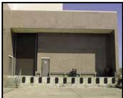
view of loading dock

Spotters are required for all vehicles backing into loading dock.